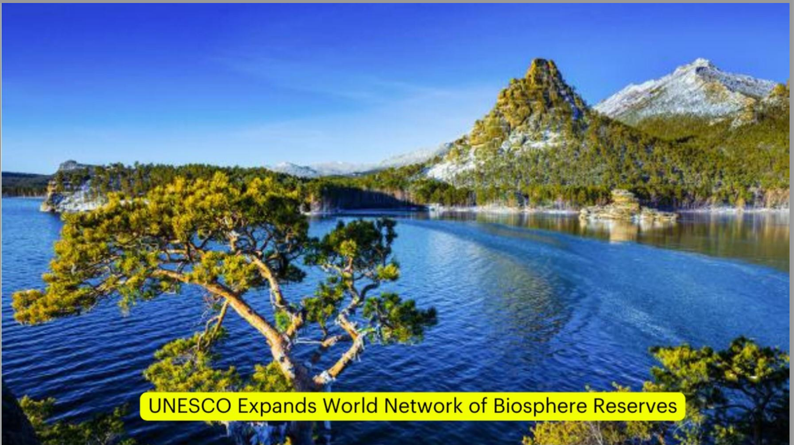
UNESCO Expands World Network of Biosphere Reserves